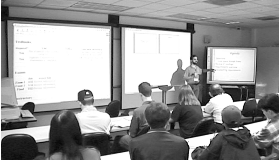
Fig. 4. In the Classroom 2000 project, we have had the ability to learn from long-term actual use in the Georgia Tech educational environment.

ence as possible to facilitate later review by both students and teachers. In many lectures, students have their heads down, furiously writing down what they hear and see as a future reference. While some of this writing activity is useful as a processing cue for the student, we felt that it was desirable from the student and teacher perspective to afford the opportunity for students to lift their heads occasionally and engage in the lecture experience. The capture system was seen as a way to relieve some of the note-taking burden.